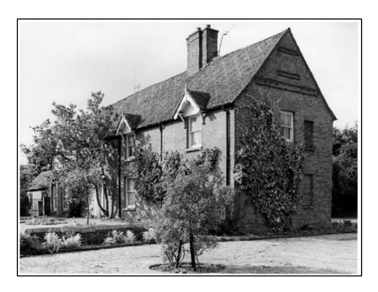
Front of house with east end 1978