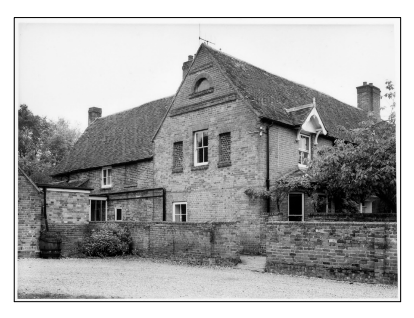
West end of house in 1972