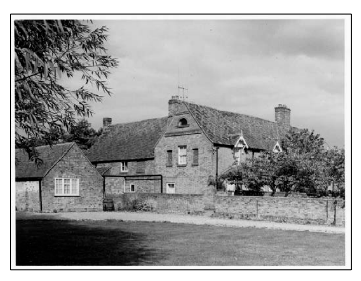
West end of house 1978